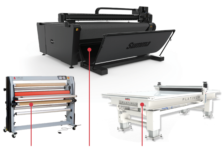
TrafficJet Laminator Summa F1612 CWT Work Table