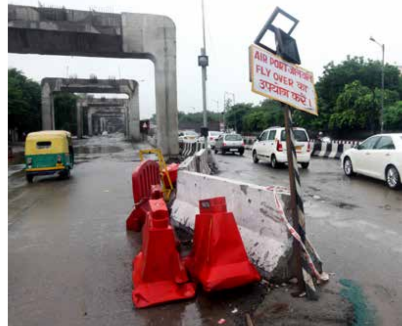
Use of Non - Reflective sign board amounts to be feckless in critical areas