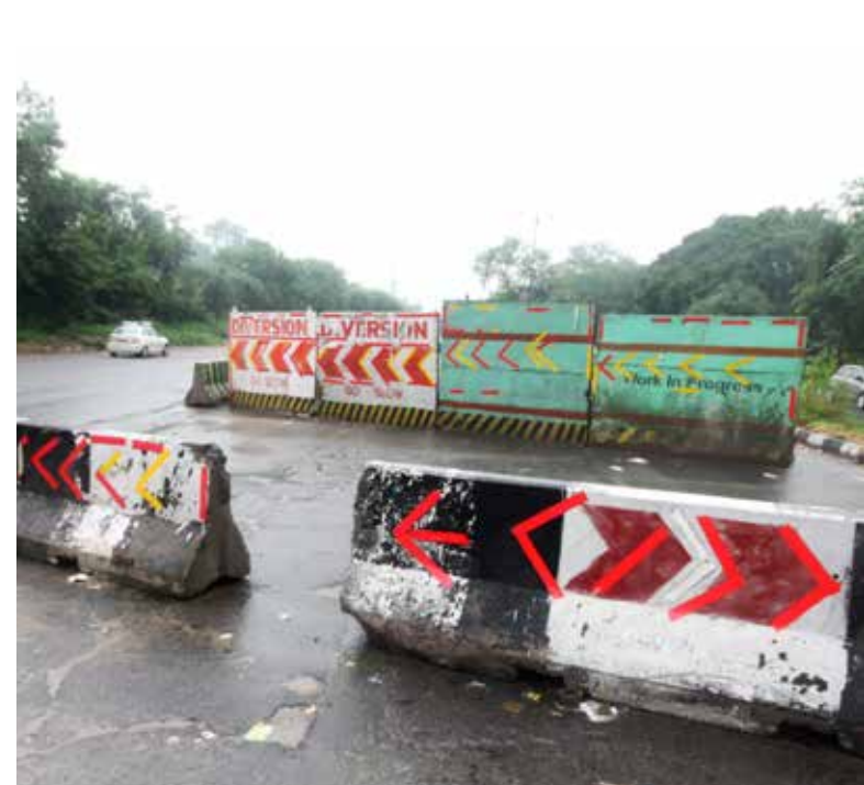
Use of Sub-Standard reflective sheets are ineffective on roads and fail to assist commuters