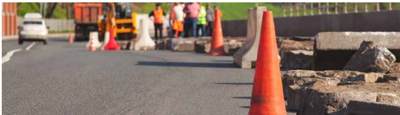
Use of non-standard road device. Devices without reflectives are ineffective

Use of sub-standard reflective sheeting which is not effective in guiding road users