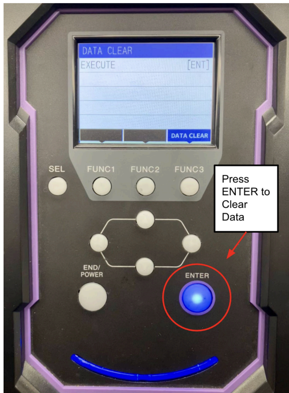
Fig 5. Execute Data CLEAR