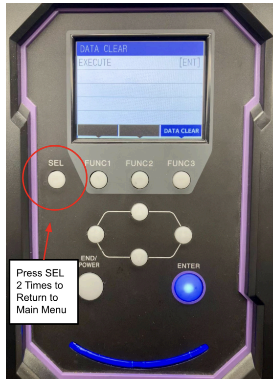
Fig 6. Navigate back to main menu