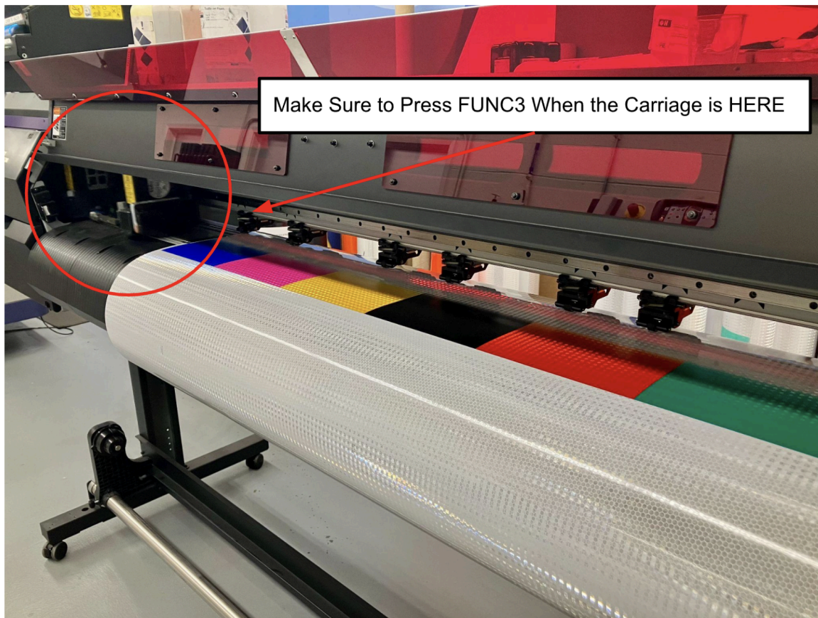
Fig 2. Carriage position while pausing

Important! Please be sure to only press FUNC3 when the carriage moves to the leftmost edge of the platen so it can cure the last bit of ink on its way back to the capping station (Fig 2).