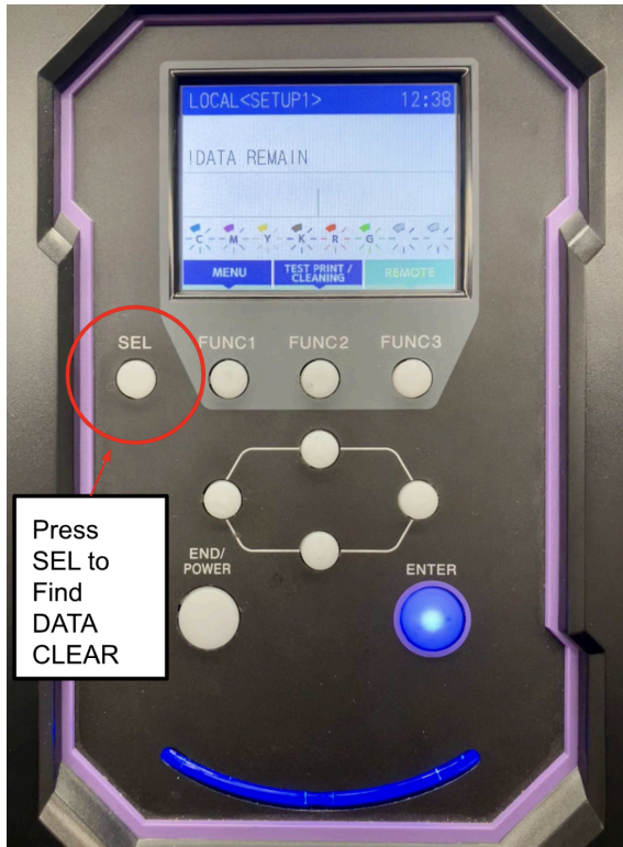
Fig 3. Navigating to Data CLEAR